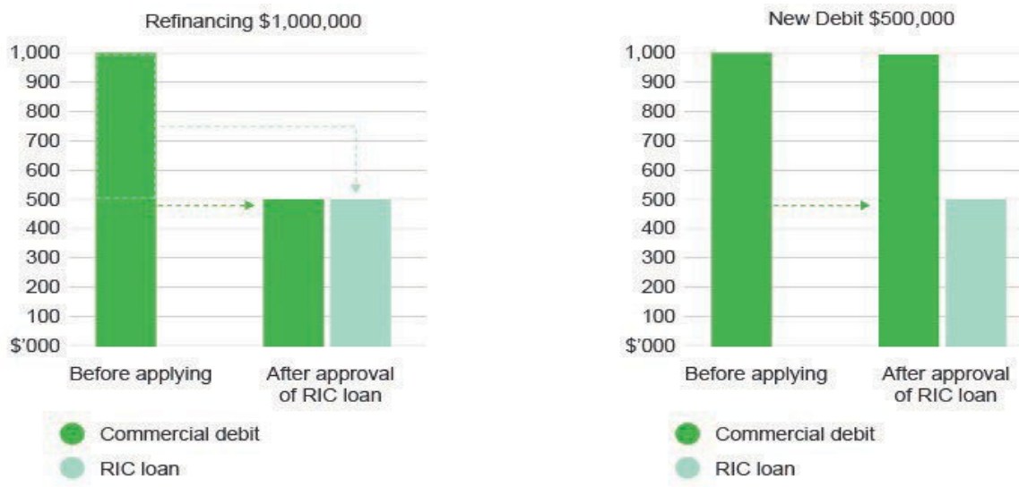
Figure 1: Maximum value of RIC loan if commercial debt of $1,000,000

Figure 1 provides examples of the maximum value of a loan for 'refinancing' and 'new debt' if a small business held $1,000,000 in commercial debt before applying for an AgBiz Drought Loan.